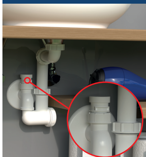
with air-admittance valve