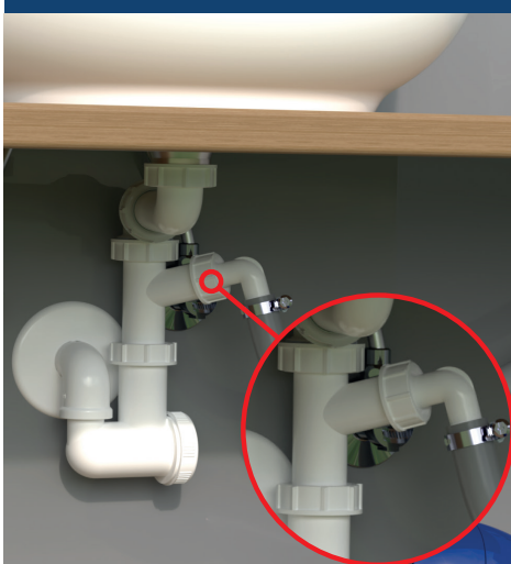
with washing machine connection